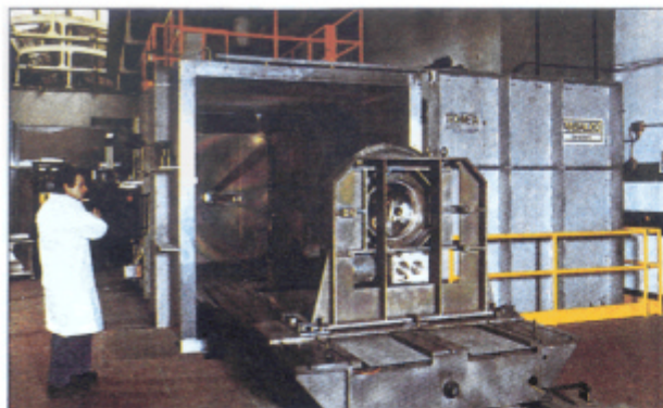
The GENOVA has a 50m 3 chamber.